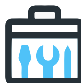
Tool Room Visitors