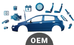
Original Equipment Manufacturers