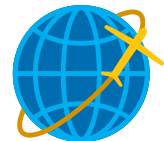
Global Partners from Tool & Die industry