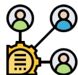
Other Institutions and Stakeholders