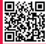
Exhibit at the 5th edition of India's leading B2B aftermarket expo

Book before 30 April 2023 to reserve a premium booth at a special discount