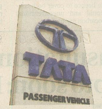
The buyout will help Tata Motors close in on Hyundai Motor India

"Given the fact that the EV plant may not need so many workers, Tata Motors