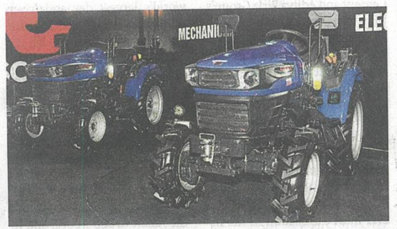
Escorts was among the first in India to showcase an electric tractor

An order passed by the National Green Tribunal directs a switchover to gas-based gensets from diesel gensets in view of the rising pollution