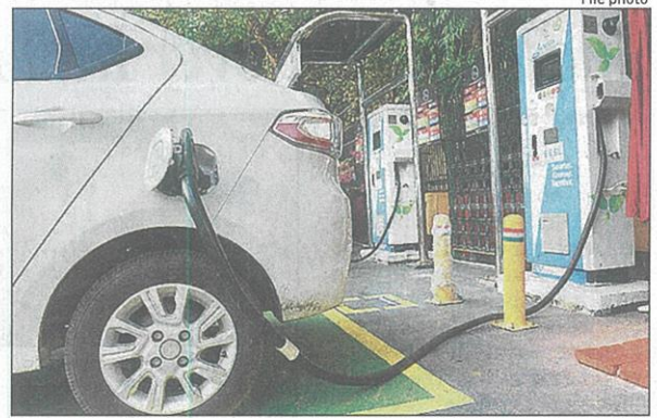
Over 500 charging connections have been provided till date

The summit was organised by the clean mobility platform EMobility+, with hundreds of stakeholders attending, including auto OEMs, supplier of manufacturing and internet of things (IOT) solutions to OEMs and tier-I