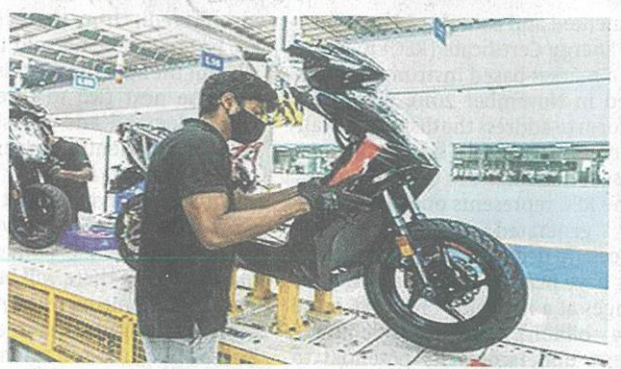
Industry watchers blame the NMC batteries for the fires

safety and fire and explosions and vehicle going in reverse of logy to focussing more on certain products, we've initiated product safety, electric two-