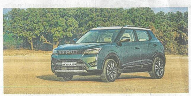
M&M has lined up a capital expenditure of ₹17,000 crore across segments between FY22 and FY24

M&M claims to be sitting on an order book of 1,78,000 units, including 78,000 for the XUV700. However, the company is able to meet only half of the demand for