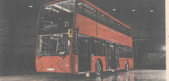
The company is expecting to create over 4,000 skilled jobs in the UK and India as part of the investment