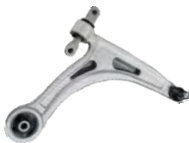
Aluminium control arms