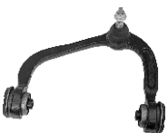
Steel Forged control arms

ISO 9001, IATF 16949, ISO 14000, Inmetro, Chas, Saso, VDA 6.3, Star Export House