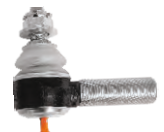
Truck suspension parts