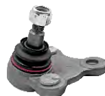
Small box Chassis parts