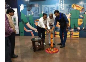
Mechatronics (Factory Auto.)- 2 21 & 22 Nov 2019, Sonipat Companies-6 Participants-13