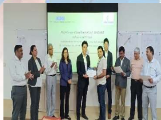
Low Cost Automation 4 to 6 Sep,2018, Sonipat Companies-19 Participants- 35