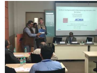
AI & MI 30 Jan to 2 Feb 2019,Pune Companies-8 Participants-16