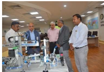
Advance Mechatronics 6 to 9 Feb 2019 Sonipat Companies-6 Participants-13