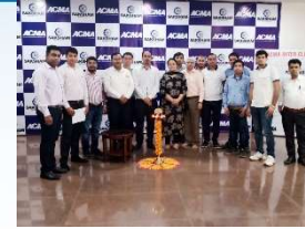
Workplace Safety 3 to 4 July 2019, Sonipat Companies-7 Participants-11