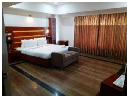
Suite room Tariff- 3,500/day + GST