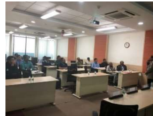
AI & MI 22 to 25 Jan 2019, Sonipat Companies-5 Participants-18