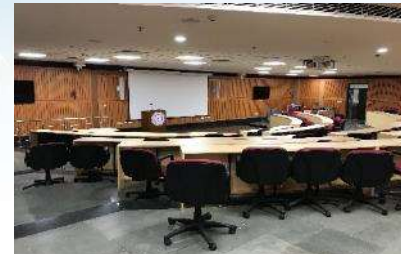
100 seater Lecture Room Tariff- 5,000/day + GST