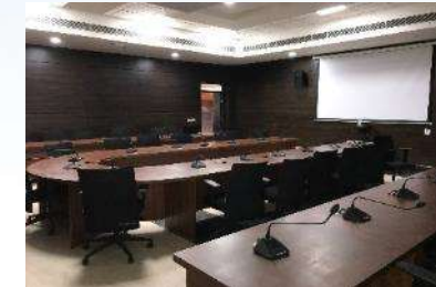
30 seater Conference Room Tariff- 5,000/day + GST