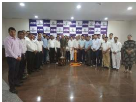
Zero Defect-2 26-27 Sep 2019, Sonipat Companies-12 Participants-31