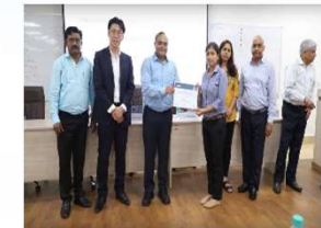
Zero Defect-1 21-22 Aug 2019, Sonipat Companies-11 Participants-53