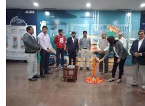
Zero Defect-3 19 Nov 2019, Sonipat Companies-2 Participants-9