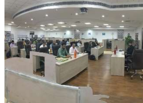
Electric Vehicle EMOBILITY 18 Nov 2019, Sonipat Companies-7 Participants-24