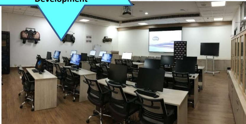
16 High End Design Workstation equipped with Design tools & Simulation tools