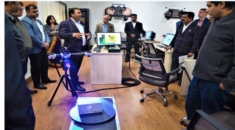
3D Scanner for scanning & converting to 2D with facility of Checking & Inspection