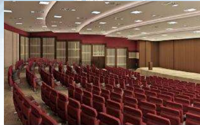
500 seater Auditorium Tariff- 30,000/day + GST