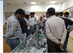
Mechatronics (Factory Auto.) 27 to 29 June 2019, Sonipat Companies-15 Participants-23