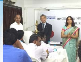
Diagnosing & improving company through Japanese Way-CHU SAN REN 27 to 31 May 2019, Pune Companies-19 Participants-49