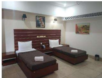
Double occupancy Deluxe room Tariff- 2,500/day + GST