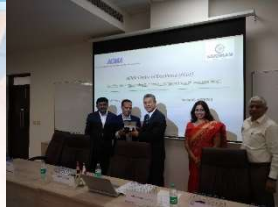
Diagnosing & improving company through Japanese Way-CHU SAN REN 20 to 24 May 2019, Sonipat Companies-21 Participants-33