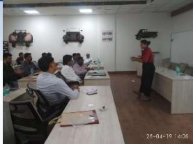
Leading High Performance Organization 28-30 April 2019, Sonipat Companies-13 Participants-23