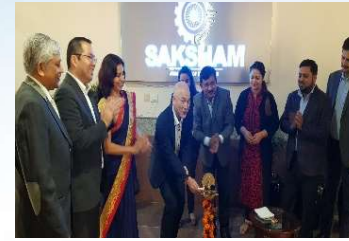
Productivity Improvement AOTS 28 to 29 Nov 2018, Sonipat Companies-9 Participants-28