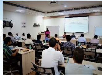
Leading High-Performance Organization 20 to 22 Nov 2018, Sonipat Companies-10 Participants-26