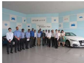
Leadership Development Program 30 Sep to 4 Oct 2019, Japan Companies-5 Participants-9